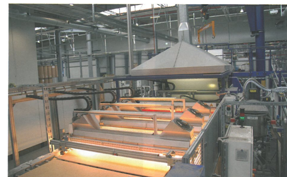
Fig. 5: Classen laminates raw boards before impregnation, decorative coating and finishing.