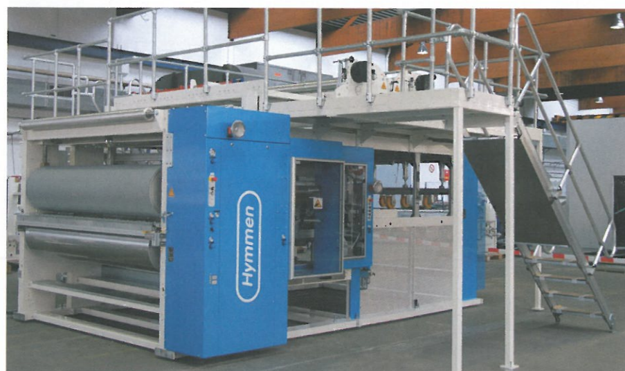
Fig. 1: One of four Laminating Lines sold by Hymmen this year: CTK with rubber calender for laminating special foils.

Hymmen laminating lines are used in all technical variants. Altogether, the company has sold more than 200 lines worldwide. Customers appreciate the very high surface quality, the pattern-matching laminating due to special camera and control systems by means of register marks, the quick foil change, the automatic foil splicing upon foil roll change, low foil losses due to precise gap control and the highly dynamic cutting system for board separation (see Fig. 3). The boards can be trimmed afterwards by means of an X-ray sensor for board recognition. Another cost-saving effect is generated by the option to use urea-formaldehyde-based adhesive on Hymmen lines. Finally, due to the experience of processes in the woodworking industry that Hymmen has accumulated over several decades, we have succeeded in integrating the laminating lines smoothly into the production processes of the manufacturers and we have even managed to provide solutions from a single source.