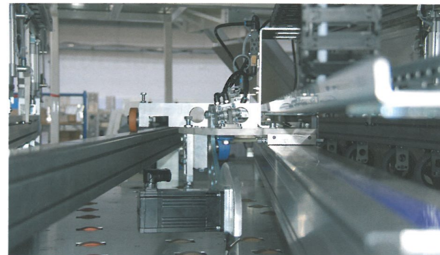
Fig. 3: Exact gap control and highly dynamic cutting system for board separation.