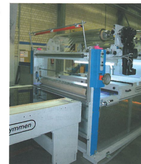
Fig. 6: The Hymmen Calender Coating Inert (CCI) Line.

A proven method is the LLT process, developed and patent-registered by Classen (see Surface Magazine 2011 and 2015). Laminating takes place at the beginning of the process when the raw boards are coated with a non-impregnated paper. The liquid impregnation of the board only takes place after the paper has been connected to the raw board. When using single-colour paper, the boards are imprinted decoratively in single pass with the Hymmen JUPITER Digital Printing Line before finishing takes place. So for Classen, laminating technology is an indispensable part of the production of high-quality laminate flooring.