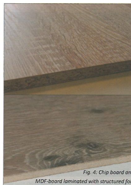
Fig. 4: Chip board and MDF-board laminated with structured foil.

In other companies, laminating technology has become an indispensable component of the whole production process. Highly individual processes have been developed.